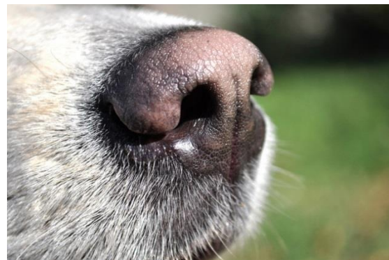
Cadaver Course Outline

The online option will include the same information.